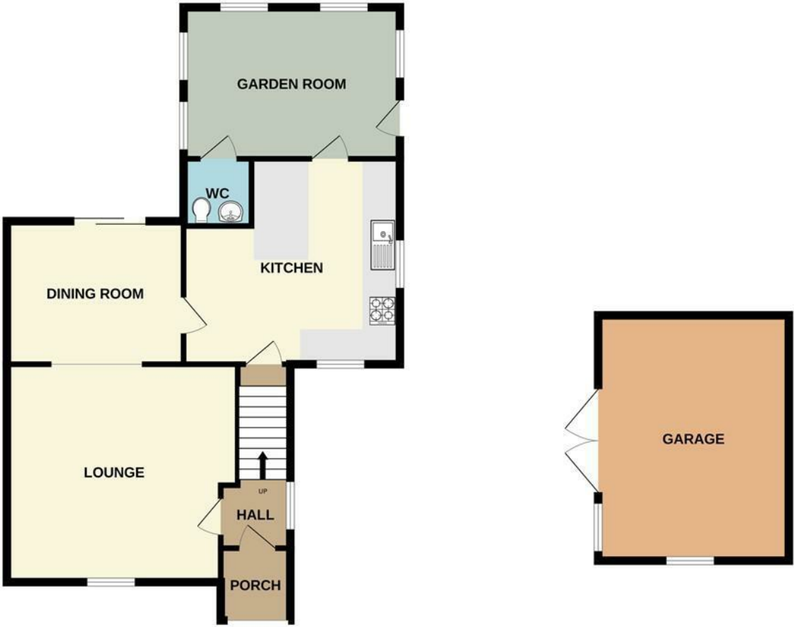
GROUND FLOOR 1027 sq.ft. (95.4 sq.m.) approx.